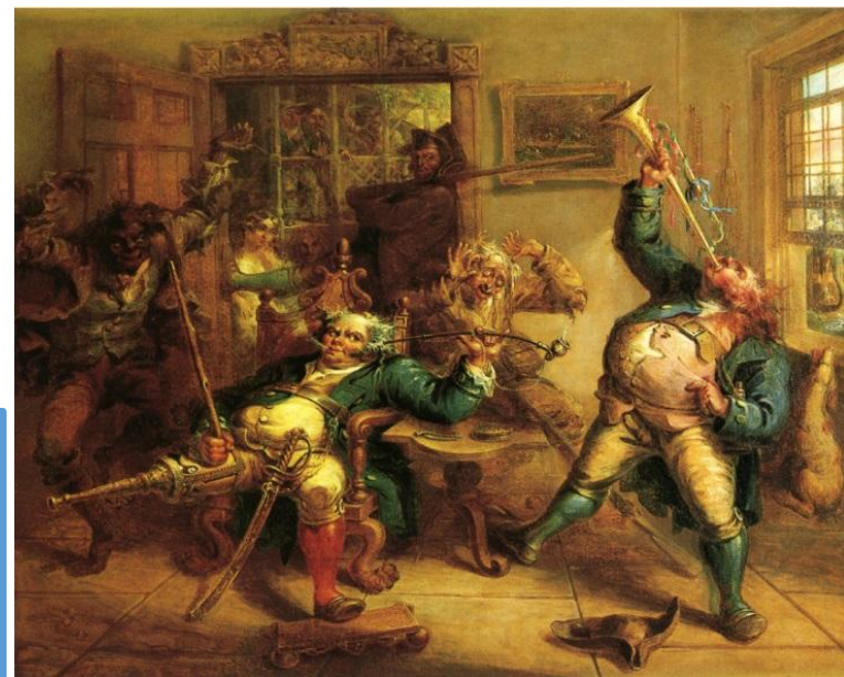
John Quidor, Antony Van Corlear Brought into the Presence of Peter Stuyvesant (1839.) 27.4" x 34.1". Munson-Williams-Proctor Art Institute.