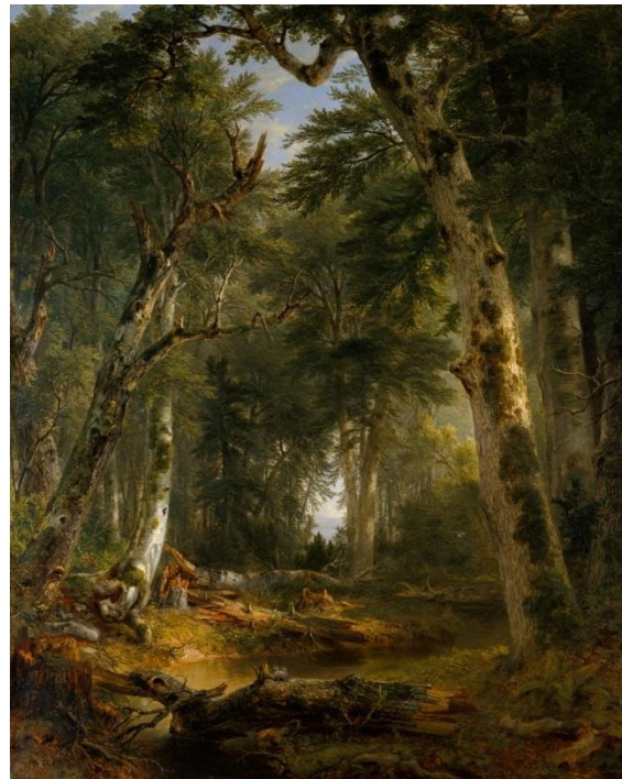
Asher Durand, In the Woods (1855). 60 ¾" x 48". Metropolitan Museum of Art

The Critical Canvas: Antebellum Narrative Painters and the Radicalization of U.S. Literature (current project)