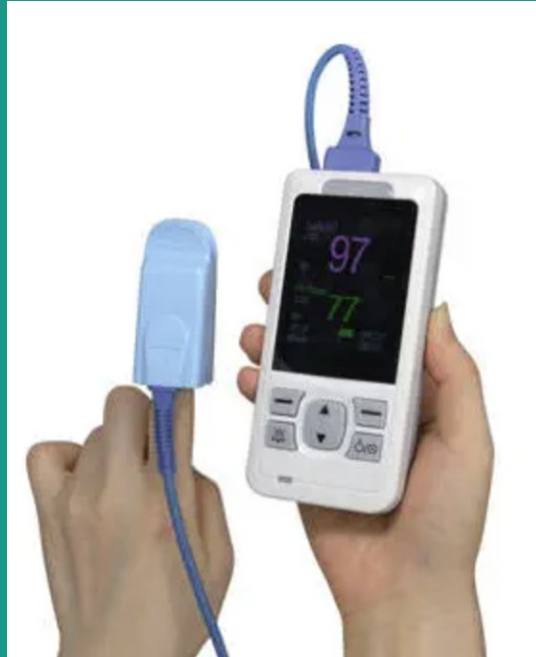
Pulse Oximeter https://www.medicaexpo.com/prod/acare/product-79300-648311.html