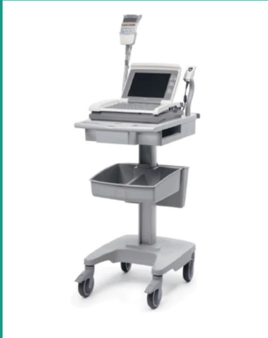
Standard ECG.