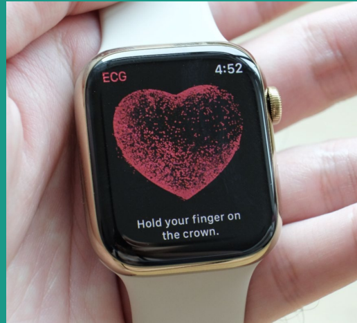
Apple Watch w/ECG Capability.