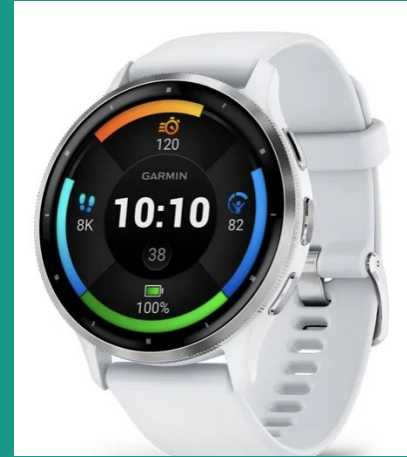
Garmin Venu Series 3 https://www.garmin.com/en-US/c/wearables-smartwatches/